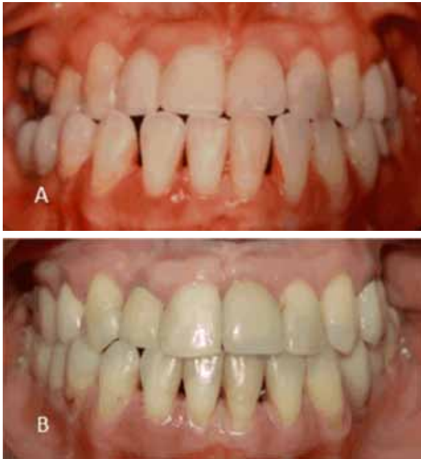
Figure 1 - Case 1: A) Initial photo of the patient. B) Final photo of the patient with implant and prosthesis on tooth 21.

of orthodontic therapy involving Class III dental compensation as the patient refused to undergo orthognathic surgery for dental and osseous correction. Orthodontic extrusion of tooth 21 was also performed prior to its extraction, and followed by placement of implant at the same region and other sites.