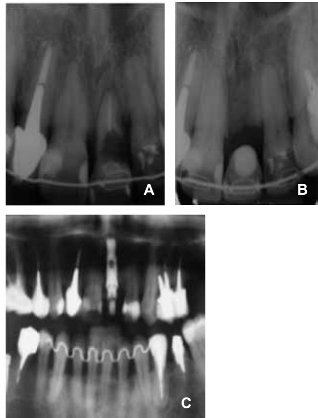
Figure 2 - Case 1: A) Initial periapical radiograph showing presence of internal resorption. B) Retention with temporary fixed appliance. C) Panoramic radiograph with implant on tooth 21.

the prosthetic portion, and during this 6-month period a temporary prosthesis was placed (Figure 2B and 2C).