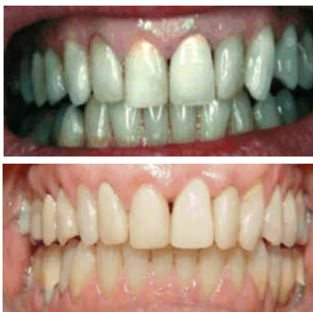
Figure 4 - Case 2: A) Initial photo of the patient. B) Final photo of the patient with implant and temporary retainer on tooth 21.