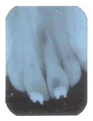
Figure 2 - Radiography showing the substitutive tooth resorption.