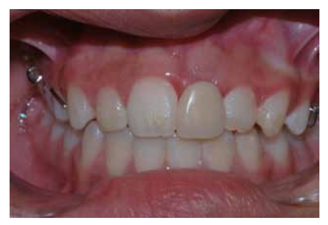
Figure 10 - Clinical evaluation 6 months after decoronation: verification of the adaptation of the aesthetic space maintainer.