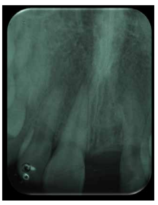
Figure 12 - Radiographic evaluation of root buried 3 years after decoronation.