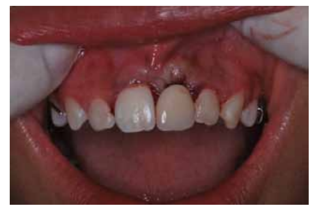
Figure 8 - Patient after surgery with aesthetic device already installed.