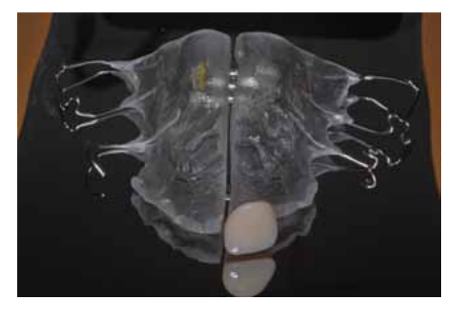
Figure 3 - Aesthetic space maintainer.