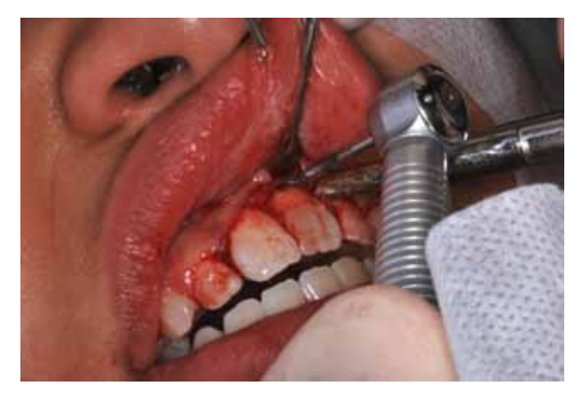
Figure 6 - Removal of dental crown with surgical drill # 702.