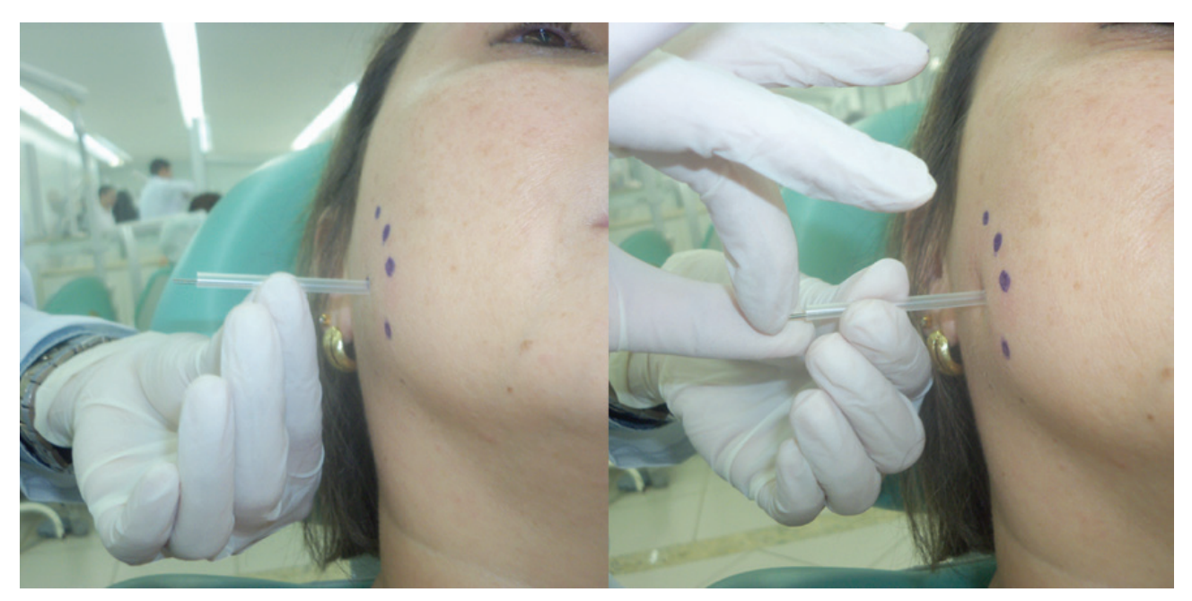
Figure 1 - Set supported the point and driven to manual touch to the contact of the needle with the trigger point (TP).

After collection, the data related to measuring pain intensity were analyzed. According to analysis of the seven moments, the mean of the individual symptomatic level reported by all patients was calculated, with the main purpose of comparing the level of pain of each patient and the entire sample, before and after treatment. Absolute and relative frequencies and descriptive measures for continuous data (mean and standard deviation) were obtained. The Kolmogorov-Smirnov test showed normal distribution of the quantitative measures (p > 0.05). The opening measures in the first session (M1) and one week after the end of treatment (M7) were compared, as well as the VAS means, through ANOVA (p < 0.05). Statistical analysis of the results was done with SPSS 14.0 software.