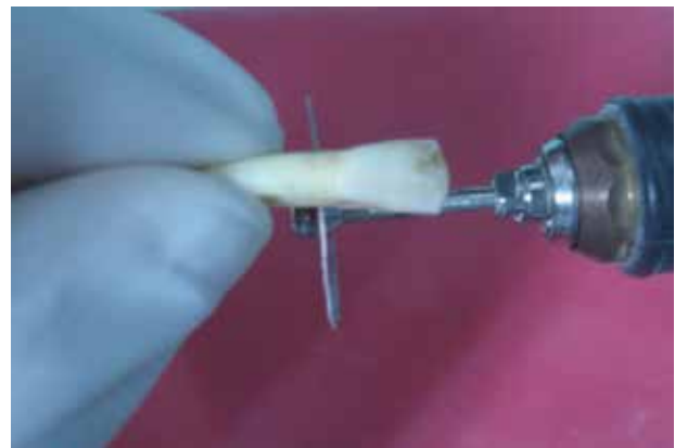
Figure 1 - Teeth were decoronated using a separating disk.

Approval was first obtained from the local ethical committee. Ninety-six healthy and recently extracted upper central incisors were collected and stored in 10% formalin. All teeth were immersed in normal saline at 37°C until preparation. The teeth were then cleaned and examined under an optical microscope (BX60, Olympus, Tokyo, Japan) to exclude teeth with cracks, caries or open apices. All teeth were decoronated using a separating disk with a water spray, retaining 12 mm of the roots (figure 1).