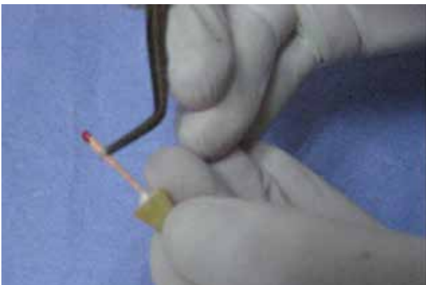
Figure 2 - Root obturation.

Root apical ends (4 mm) were vertically embedded into plastic boxes (13 mm in height and 15 mm in diameter) that were filled with a chemically polymerized acrylic resin (Vertex