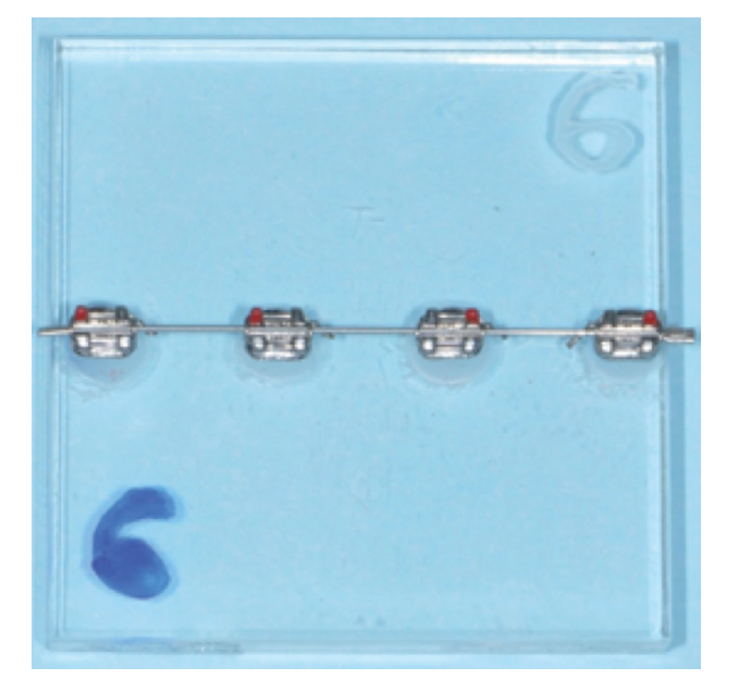
Figure 1 - Brackets bonded on one of the surfaces of the acrylic plate with orthodontic archwire in place.

For cycling, a vertical force (parallel to the plate) of 3 N and frequency of 2 Hz was applied between the two central brackets (that represented the maxillary central incisors) with a point denominated "counter-part" on which a steel wire 1.6 mm in diameter was fixed,