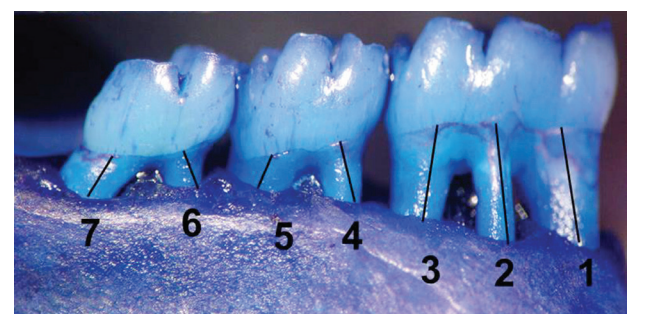
Figure 2 - Photograph of the periodontal bone loss (PBL) morphometrically assessed by measuring the linear distance between cement-enamel junction and alveolar bone crest at lingual sites in the first mandibular molar (first, second, and third molars) (X50). The lines indicate the seven distances measured in the teeth.

The method described by Crawford et al. [16] to measure distances in digitized images was used to perform the linear measurements from CEJ to ABC, in one-half of each root by following the axis at seven lingual sites in each mandible. Three measurements were taken in the first molar, two in the second molar, and two in the third molar. This method was also applied to the lingual aspect of the left mandible (Figure 2).