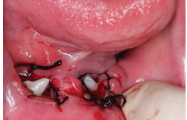
Figure 4 - Surgery for lower canines exposure.