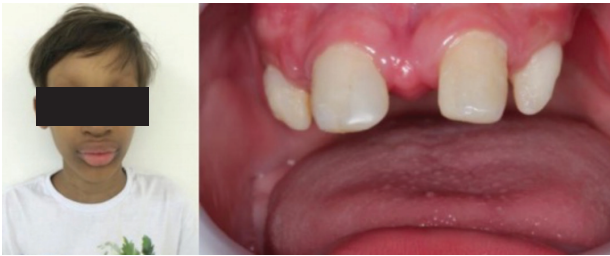
Figure 2 - Face and oral cavity of the patient.

In addition to the orthodontic approach of teeth 11 and 21, these were restored with 3M photopolymerizable resin microparticulate in colors A2 and E1 (Figure 6). After that, a removable prosthesis was made to finish the rehabilitation treatment.