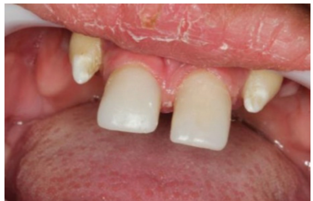
Figure 6 - Restoration with photopolymerizable resin microparticulate of teeth 11 and 21.