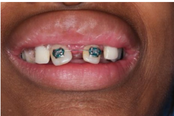
Figure 3 - Placement of brackets to approach the teeth 11 and 21 and closure of the interincisal dysthem.