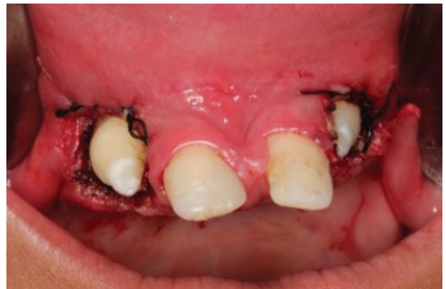
Figure 5 - Surgery for upper canines exposure.