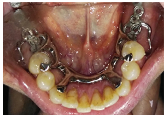
Figure 3 - Try in of metal framework.