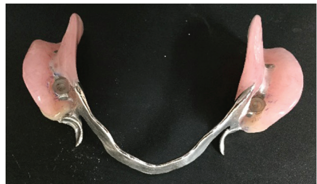
Figure 2 - Nylon caps inserted in the fitting surface of the RPD.