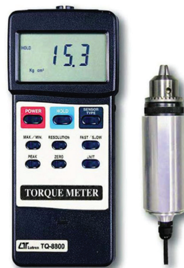
Figure 1 - Digital torque meter was used for tightening, retightening and measuring the RTV.

tightened using the digital torque meter (Lutron Electronic Enterprise Co., Taiwan) (Figure 1) according to the instructions with a force of 30 N.cm [11]. In order to compensate the settling effect, the abutment screws were re-tightened by the digital torque meter with a force of 30 N.cm after 10 min [1,12] (Figure 2).