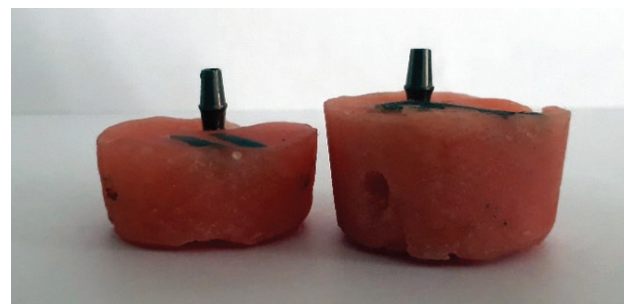
Figure 2 - Samples include short and standard implants are mounted and their abutments in different cuff heights are tightened.

The samples were coded from 1 to 20, (1-10 for standard implants and 11-20 for short ones). All the samples were then tested with a cyclic loading machine (Chewing Simulator CS-4, SD Mechatronik, Germany) to simulate the chewing forces and to apply a cyclic load of 75 N.cm with a frequency of 1 Hz at the