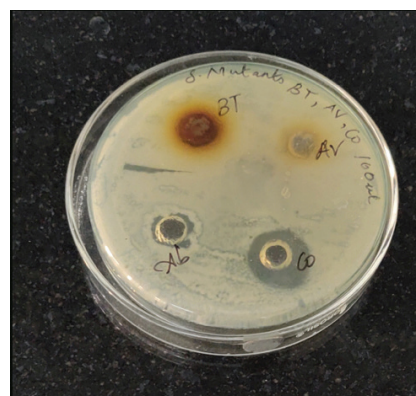
Figure 4 - Muller Hinton agar plate with S. mutans - ZOI of 100 \mu l of AV (Aloe vera extract), BT (Black tea extract), CO (Coriander oil) and 30 \mu l Ab (amoxicillin).