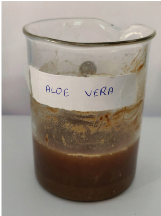
Figure 1 - Mixture of 5 g of dried Aloe vera leaf powder in 100 ml distilled water.