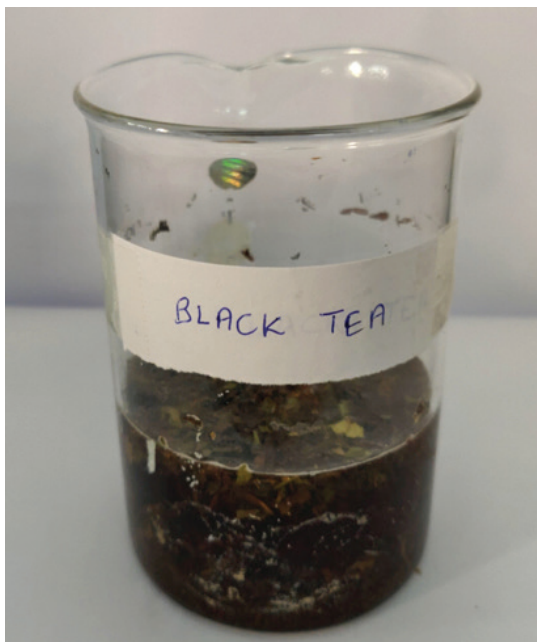
Figure 2 - Mixture of 10 g of black tea powder in 100 ml distilled water.