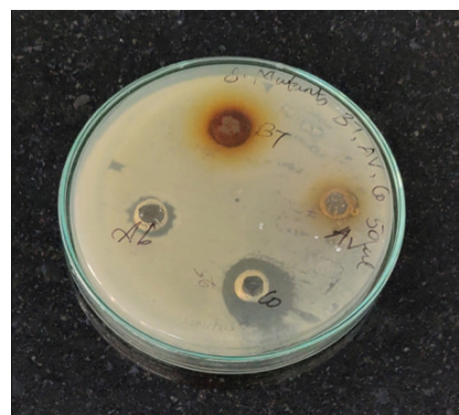
Figure 3 - Muller Hinton agar plate with S. mutans - ZOI of 50 \mu l of AV (Aloe vera extract), BT (Black tea extract), CO (Coriander oil) and 30 \mu l Ab (amoxicillin).