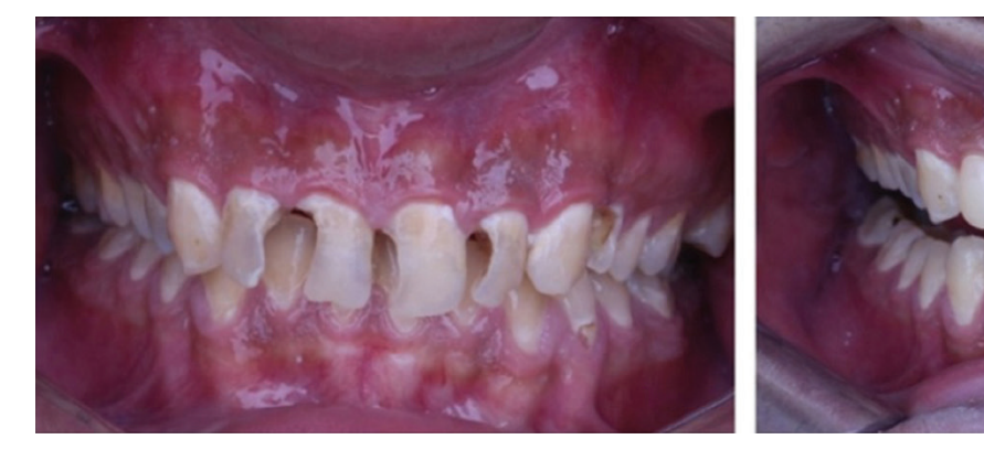
Figure 4 - Pre and post-operative CERASMART endocrown.