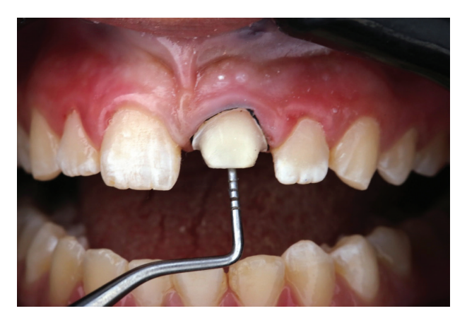
Figure 1 - Pulp chamber preparation depth checking by periodontal probe.

Vinvl polysiloxane elastomeric impressions (Elite HD+, Zhermack SpA - Via Bovazecchino, 100 - 45021 Badia Polesine (RO), Italy)were made, and provisional restorations (Structur 2 SC, VOCO, Germany) were cemented with non-eugenol provisional cement (RelyX Temp NE, 3MESPE, USA). The IPS e.max press endocrowns were constructed using a pressing furnace (Programat EP 3010, Ivoclar. VivadentAG,Schaan/Liechtenstein): the CERASMART endocrowns were constructed using a CAD/CAM Cerec inLab MC X5 milling machine with Cerec 15.0.0 software. The fitting surfaces of the all-ceramic crowns were treated and silanated according to the manufacturer's instructions and the abutment teeth were prepared with self-etch adhesive protocol using adhesive resin cement (BisCem, Bisco, United States) (Figures 3–6).