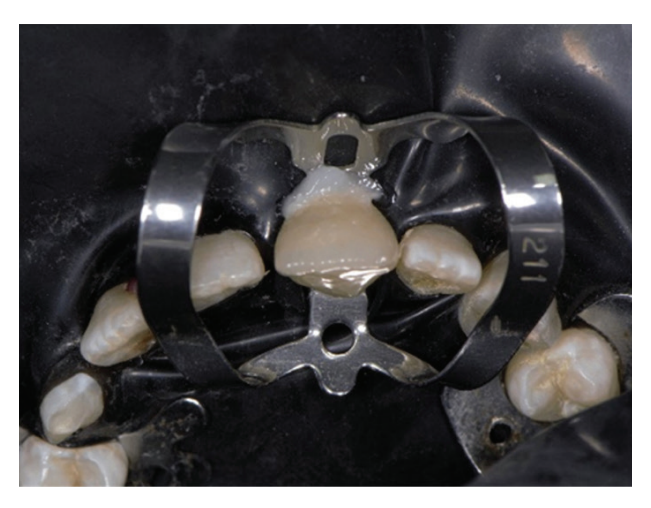
Figure 3 - Cementation of endocrown.