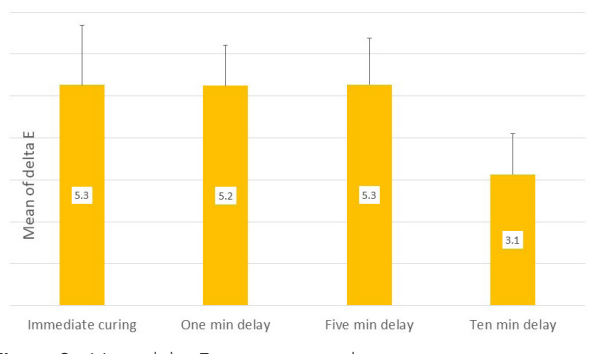
Figure 2 - Mean delta E in experimental groups.

6 months later in the study groups (Figure 3). Minimum change in opacity was noted in the 10 min group while maximum change was noted in 1 min group. One-way ANOVA indicated a significant difference in this respect among the groups (P < 0.001). The Tukey's HSD test indicated significant differences between the 10 min group and all other groups (P < 0.002).