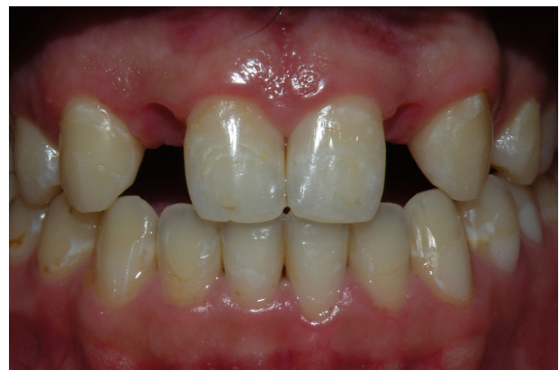
Figure 1 - Anterior view of the patient with lateral agenesis.

After orthodontic treatment, the patient was obliged to use lateral teeth added Hawley retainer until completion of his prosthetic treatment for the maintenance of the space. Considering treatment options, implant rehabilitation was rejected because of the inadequate bone volume and the patient's disapproval for advanced surgical procedures for hard and soft tissue augmentation. Therefore, single tooth retained,