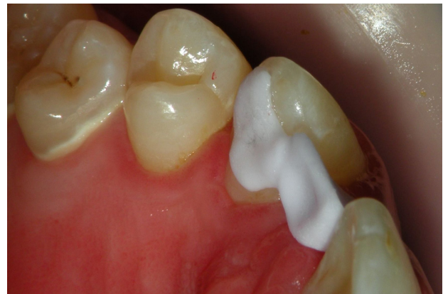
Figure 3 - Try-in of the lithium disilicate substructure before crystallization.