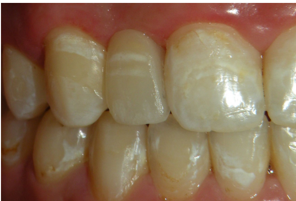
Figure 6 - Right RBFDP after adhesive cementation.

Leucite based glass-ceramic suprastructures were etched with 9.5% HF for 40 seconds, simultaneously. Both surfaces were silanated for 60 seconds (Monobond Plus, Ivoclar Vivadent) and air dried. Bonding agent (Heliobond, Ivoclar Vivadent) was applied, air-thinned and pieces were cemented to each other with dual curing resin cement (Variolink II, Ivoclar Vivadent). Excess cement was removed with an applicator and light polymerization was made for 40 seconds from all aspects of the restorations. Final views of the restorations are shown in Figure 6 and 7.