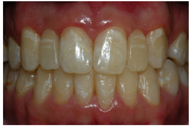
Figure 7 - Anterior view of the final restorations.