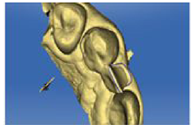
Figure 4 - Digital marginal drawing of the suprastructure.

Multi, Ivoclar Vivadent) to imitate the color gradient between the cervical and incisal edge of natural teeth.