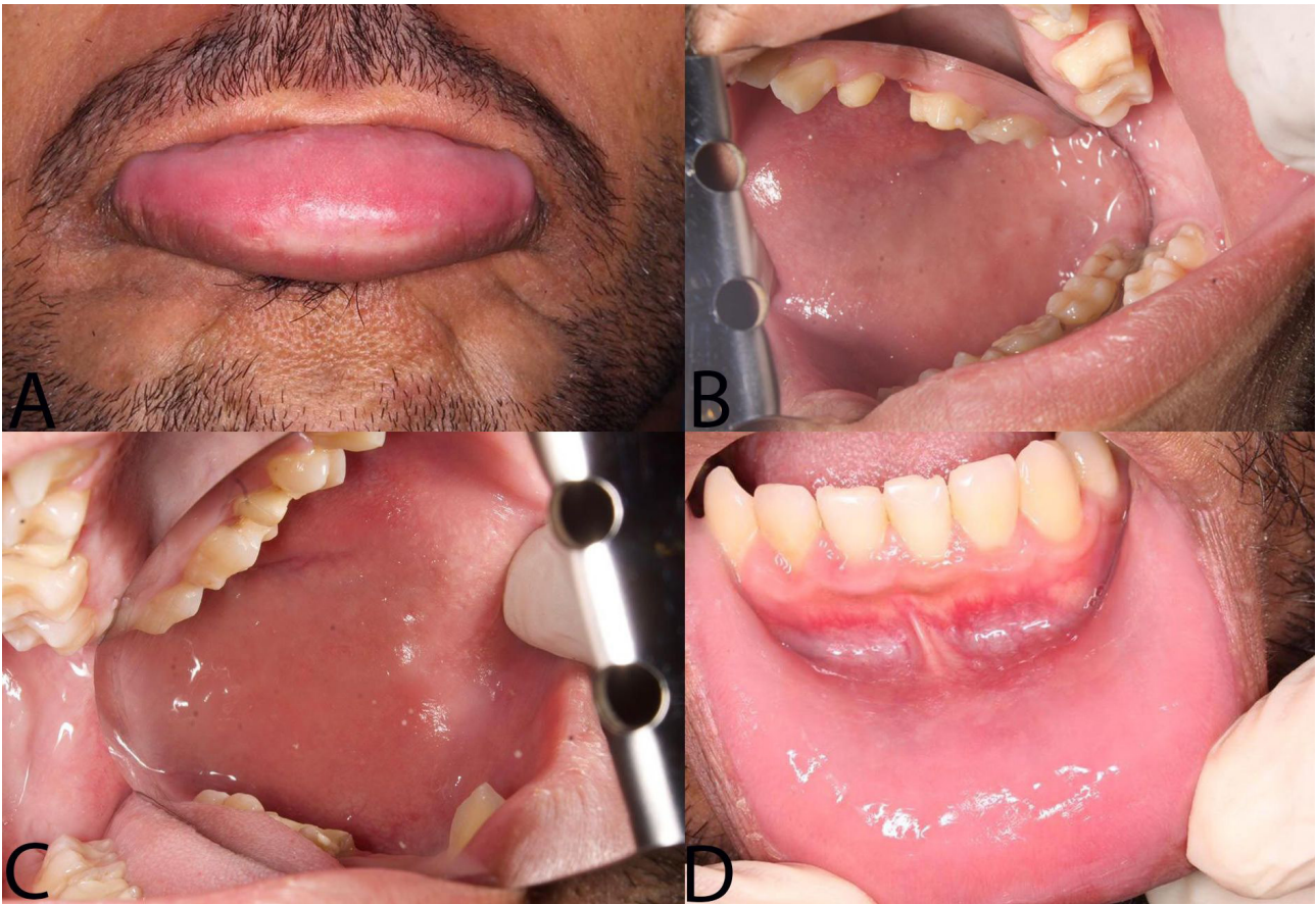
Figure 2 - Healing of lips and oral mucosa after 10 days from treatment.