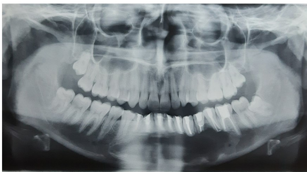
Figure 2 - Three months post-operative pantomogram showing persistent mandibular radiolucency, no radiographical signs of recurrence.

4 involved anterior region, whereas 5 lesions were located in maxilla, out of which 3 involved anterior region and 2 involved posterior region. All patients were followed up for four to five years, post-operatively. None of the cases showed any recurrence throughout the period of follow-up, which might be indicative of the presented protocol being an effective option. Paraesthesia for a maximum of 6 weeks was noted in four patients and wound dehiscence in three, no other complications were noted (Table I).