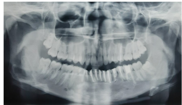
Figure 3 - Five years post-operative pantomogram showing complete ossification of bone, no radiographical signs of recurrence can be seen.

4 involved anterior region, whereas 5 lesions were located in maxilla, out of which 3 involved anterior region and 2 involved posterior region. All patients were followed up for four to five years, post-operatively. None of the cases showed any recurrence throughout the period of follow-up, which might be indicative of the presented protocol being an effective option. Paraesthesia for a maximum of 6 weeks was noted in four patients and wound dehiscence in three, no other complications were noted (Table I).