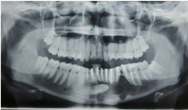
Figure 1 - Pre-operative pantomogram showing multilocular OKC involving anterior mandible and left side body, impacted canine is also seen.