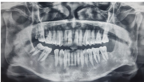
Figure 5 - Four years post-operative pantomogram showing complete ossification of bone, no radiographical signs of recurrence can be seen.