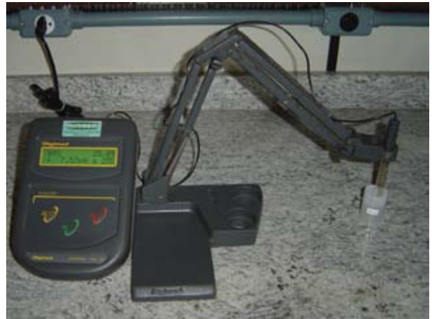
Figure 2 – pHmeter (Digimed DM 20).