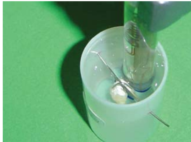
Figure 3 – Device for fixation of teeth.

observed for 30% hydrogen peroxide (Table 1). These results confirm the alkalinity of the association of sodium perborate with water and the acidic pH of hydrogen peroxide, observed during analysis of pH of these materials.