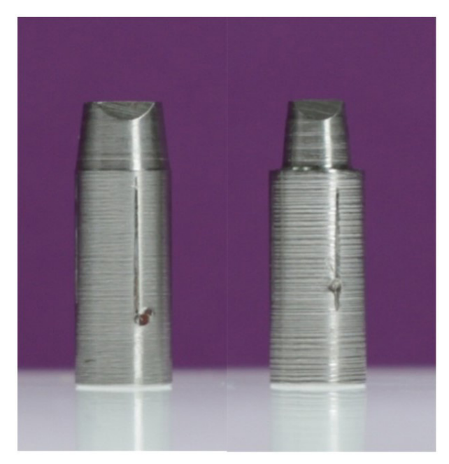
Figure 1 - Showing vertical preparation of 0.1 mm feather-edge design on the left and horizontal 1 mm radial shoulder on the right.

Each stainless-steel die was duplicated into an epoxy resin die using a non-shrink epoxy resin material (Kempoxy 150 transparent, CMB, Cairo, Egypt). 40 epoxy resin dies were fabricated from each design. Each epoxy resin die was scanned using CEREC Omnicam intraoral scanner (Dentsply Sirona, Bensheim, Germany). Eighty full contour monolithic ceramic crowns were designed and milled using CEREC CAD/ CAM system (CEREC MCXL, Dentsply Sirona, Germany) and divided into two groups (n=40)