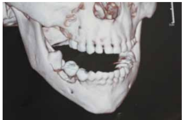
Figure 3 - CT revealed infiltration on right buccal and lingual mandibular cortical. The inferior cortical remains intact.