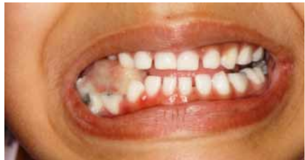
Figure 2 - Note the displacement of teeth 84, 85 and 46, and the patient difficulty of occluding properly because of tumor volume.