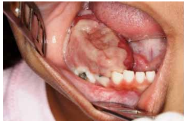
Figure 1 - Nodular sessile base lesion, approximately 5 cm in its largest diameter, imprinting of upper teeth on the lesion surface.

This patient remains with no signs of recurrence and has been monitored for more than 20 months.