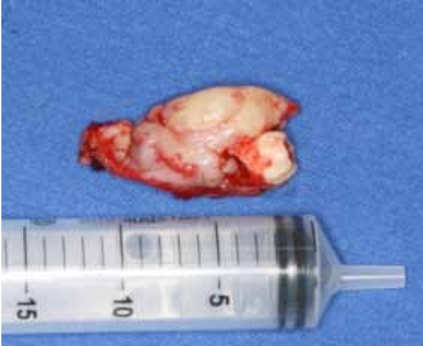
Figure 4 - Lesion and intralésional deciduous teeth, after removal.