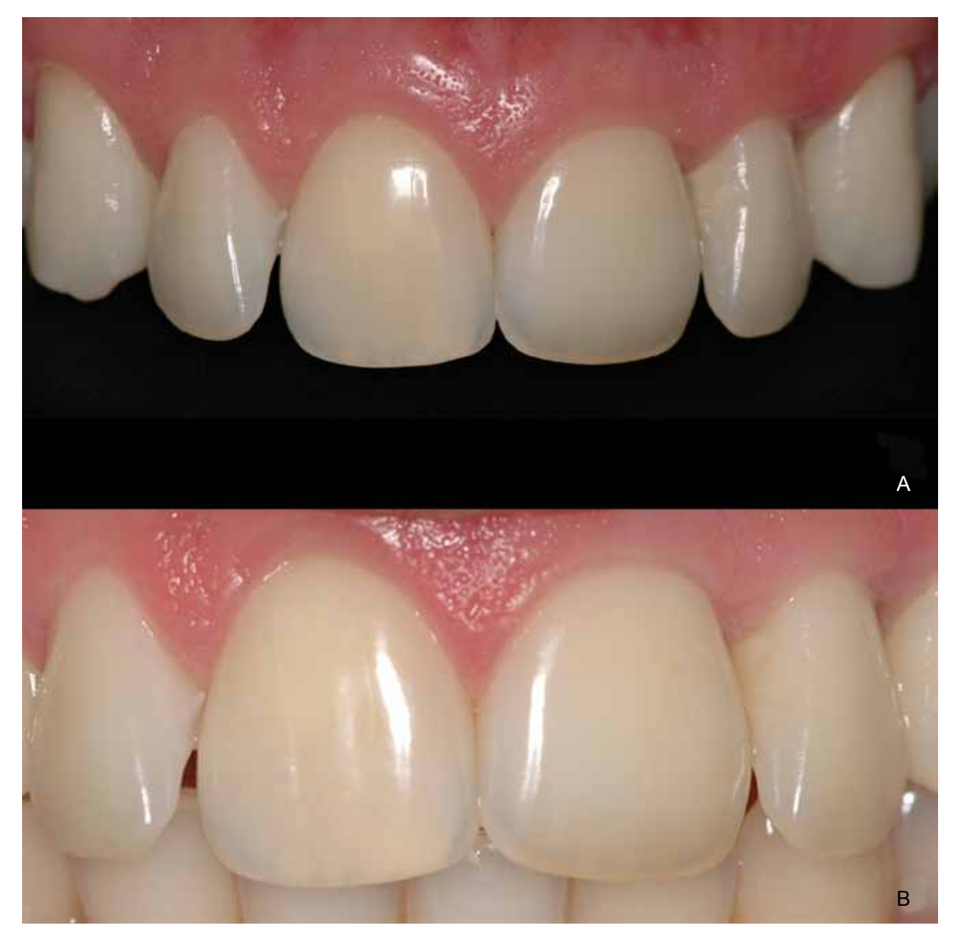
Figure 4 – (A) Buccal view of the tooth 11 after combined bleaching treatment and (B) patient's smile three months after conclusion of the bleaching treatment.