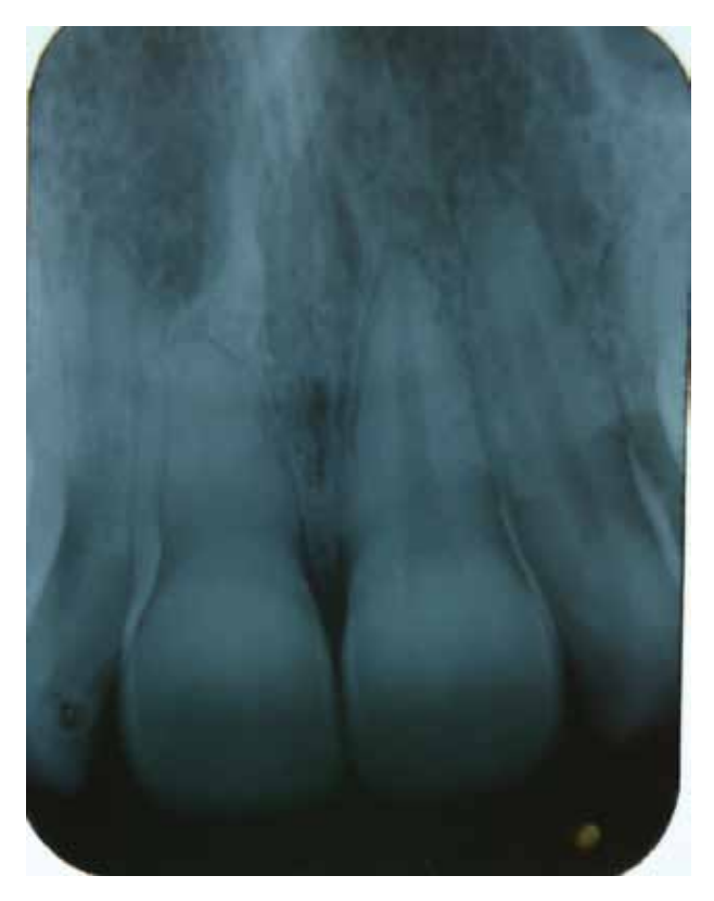
Figure 2 – Radiographic exam of the tooth 11, suggestive of dystrophic calcification of the pulp without periapical lesion.