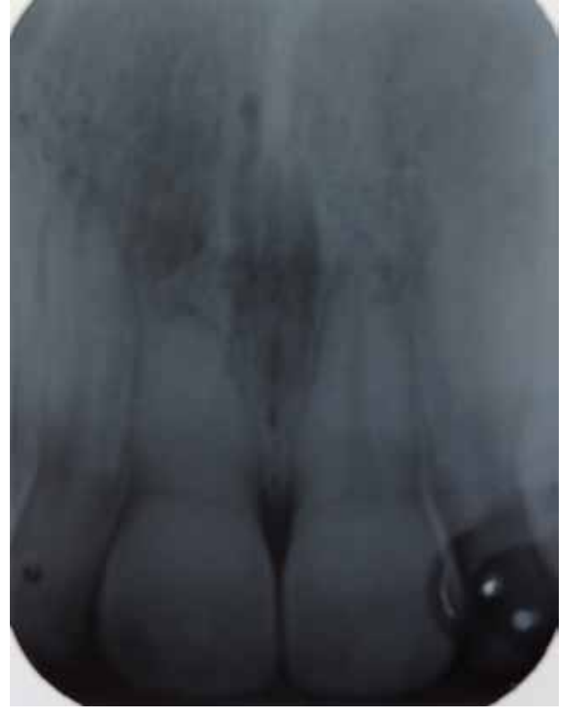
Figure 5 – Radiographic exam of the tooth 11, after 5 years of follow-up.