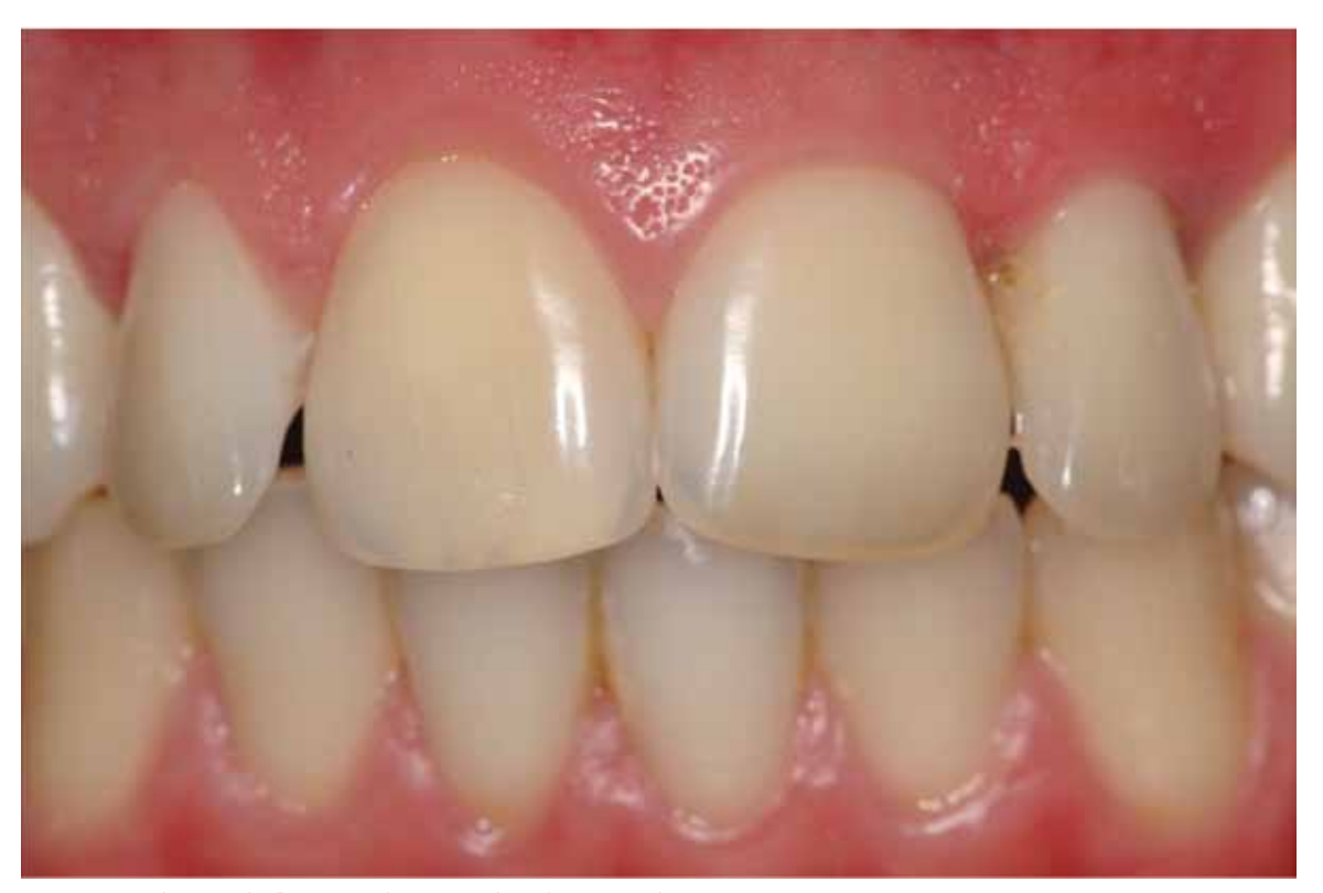
Figure 5 – Patient's smile five years after conclusion of the bleaching treatment.