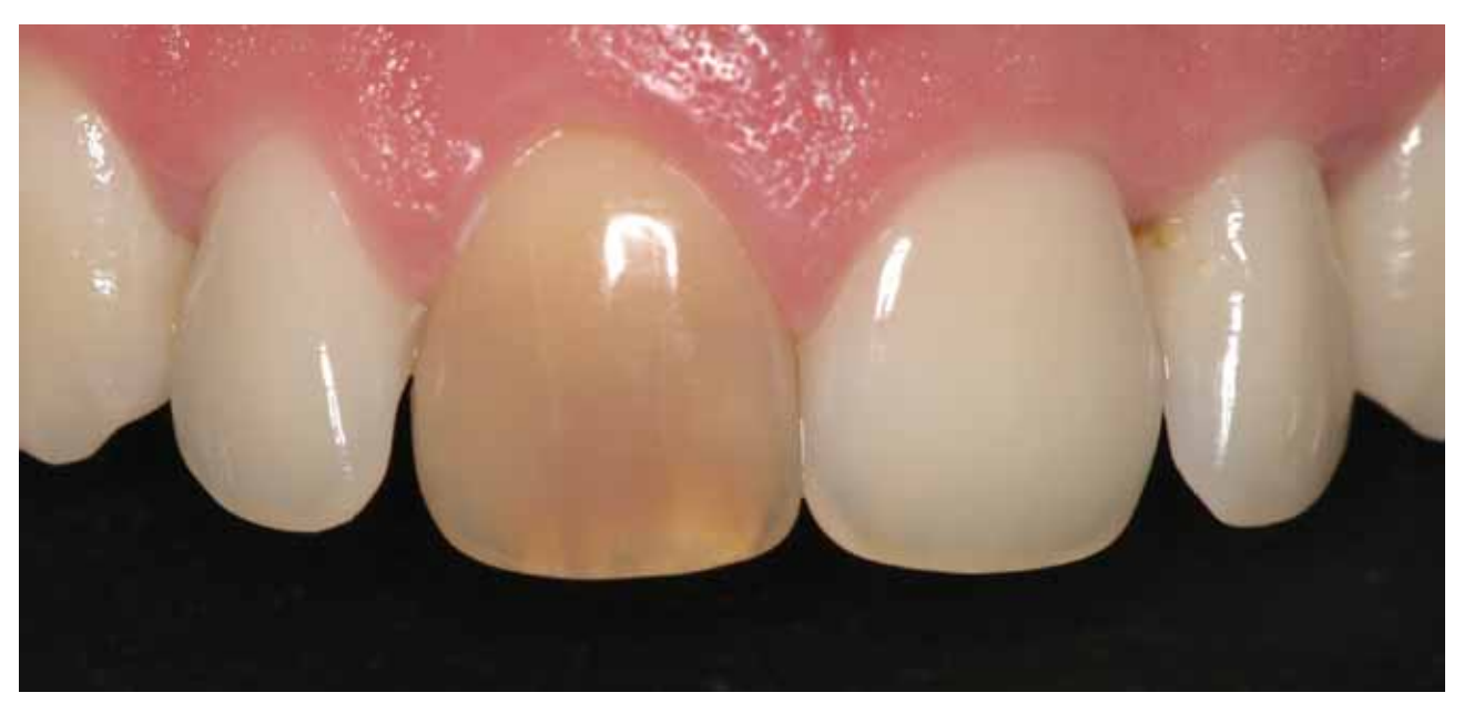
Figure 1 – Microstrain (με) results distribution according to base material and restorative technique (interquartile values).